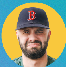
@NOBODYCARESANTHONY 115,602 VIEWS