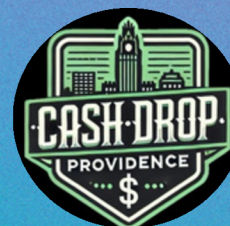
@CASHDROPPROVIDENCE 139,500+ VIEWS